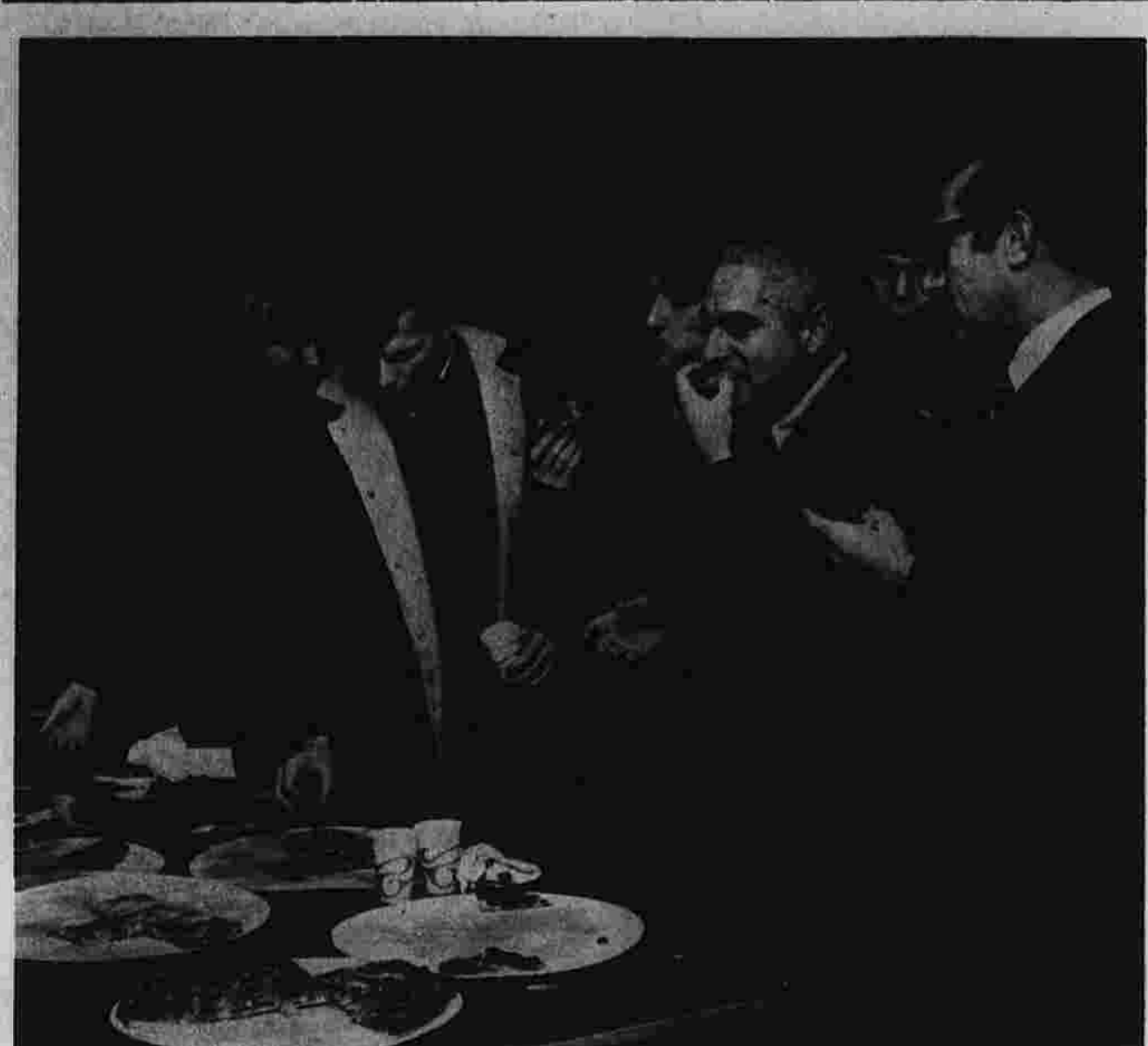
Brotherhood in Action gave an appreciation party last night at the Kofc Home for teen-agers who have worked as volunteers renovating the Teen Center in Manchester Recreation Area.

The decision also raised Commission Chairman C. Jackson Grayson to status as the dominant figure within President Nixon's apparatus for dealing with inflation. "This coal settlement was made after the wage guidelines were known," Grayson said in announcing that the Old Ben Coal Co., a subsidiary of Standard Oil of Ohio, would be allowed to pass along only 9.8 per cent of the wage hike. From now on, Grayson said, the commission "will take a very careful look" at any request for a price hike based on wage settlements above the Pay Board's 8.5 per cent guideline.